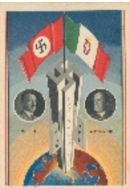
Hitler and Mussolini create Rome-Berlin Axis 01/10/1936