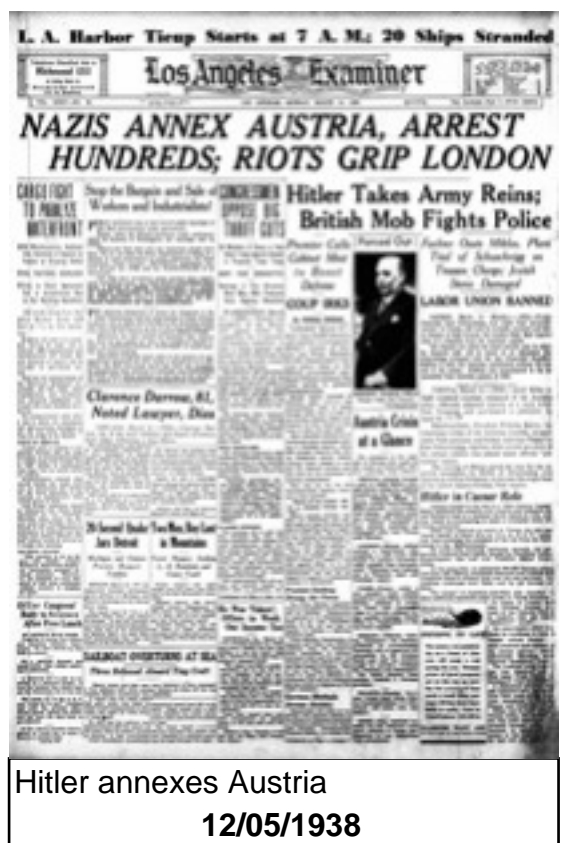
Hitler annexes Austria 12/05/1938