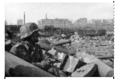
Germany suffers setbacks at Stalingrad 12/12/1942