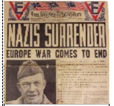
Germany surrenders 07/05/1945