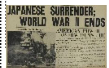
Japan surrender 02/09/1945