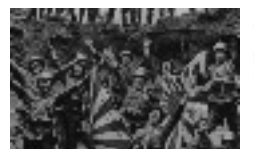
Singapore falls to the Japanese 15/06/1942