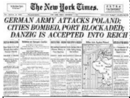
Hitler invades Poland 01/09/1939