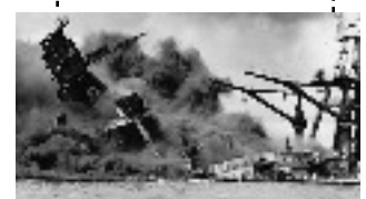
Pearl Harbor attack 07/12/1941