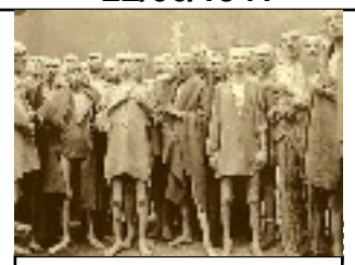
Mass murder of Jewish people at Auschwitz begins 01/03/1941