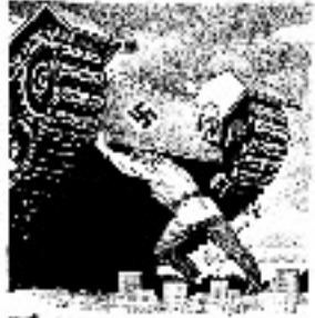
Surrender at Stalingrad marks Germany's first major defeat 31/01/1943