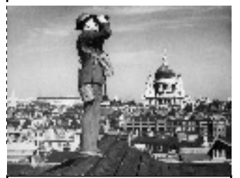
British victory in battle of Britain forces 17/09/1940