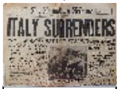
Italy surrenders 03/07/1943