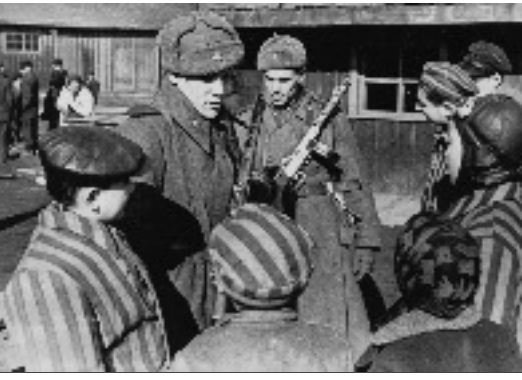
Auschwitz liberated by Soviet troops 29/04/1945