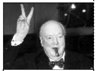
Churchill becomes prime minister of Britain 10/05/1940