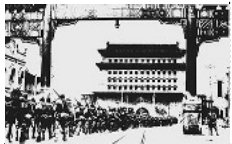
Japanese seize Chinese capital 05/10/1937