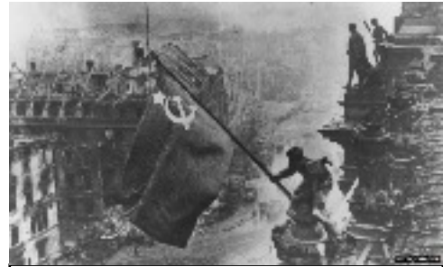
Russians reach Berlin 16/04/1945