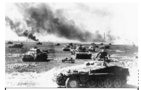
Hitler begins Operation Barbarossa – the invasion of Russia 22/06/1941