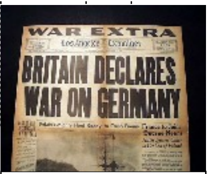
Britain and France declare war on Germany! 03/09/1939