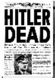
Hitler commits suicide 30/04/1945