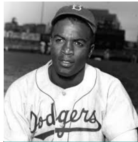
Segregation disappears ... in professional baseball with the integration of Jackie Robinson in the Brooklyn Dodgers 1947