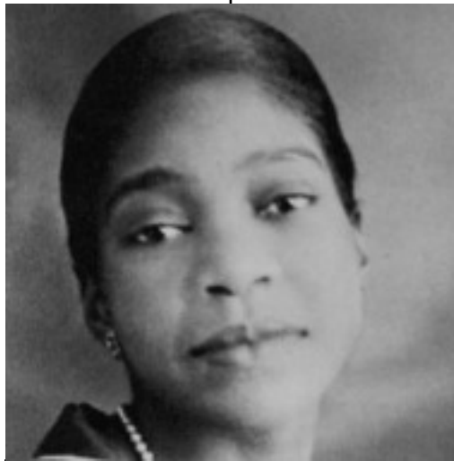
Seriously injured in a car accident in Clarksdale, Mississippi, the acclaimed blues singer Bessie Smith was refused entry to the local hospital because of her skin color and died shortly before reaching Memphis. 1937