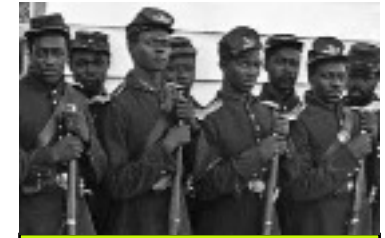
The last unit of American forces composed entirely of blacks was dissolved during the Korean War (1950-1953). 1952