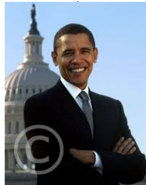
Election of Democrat Barack Obama at the White House 2008